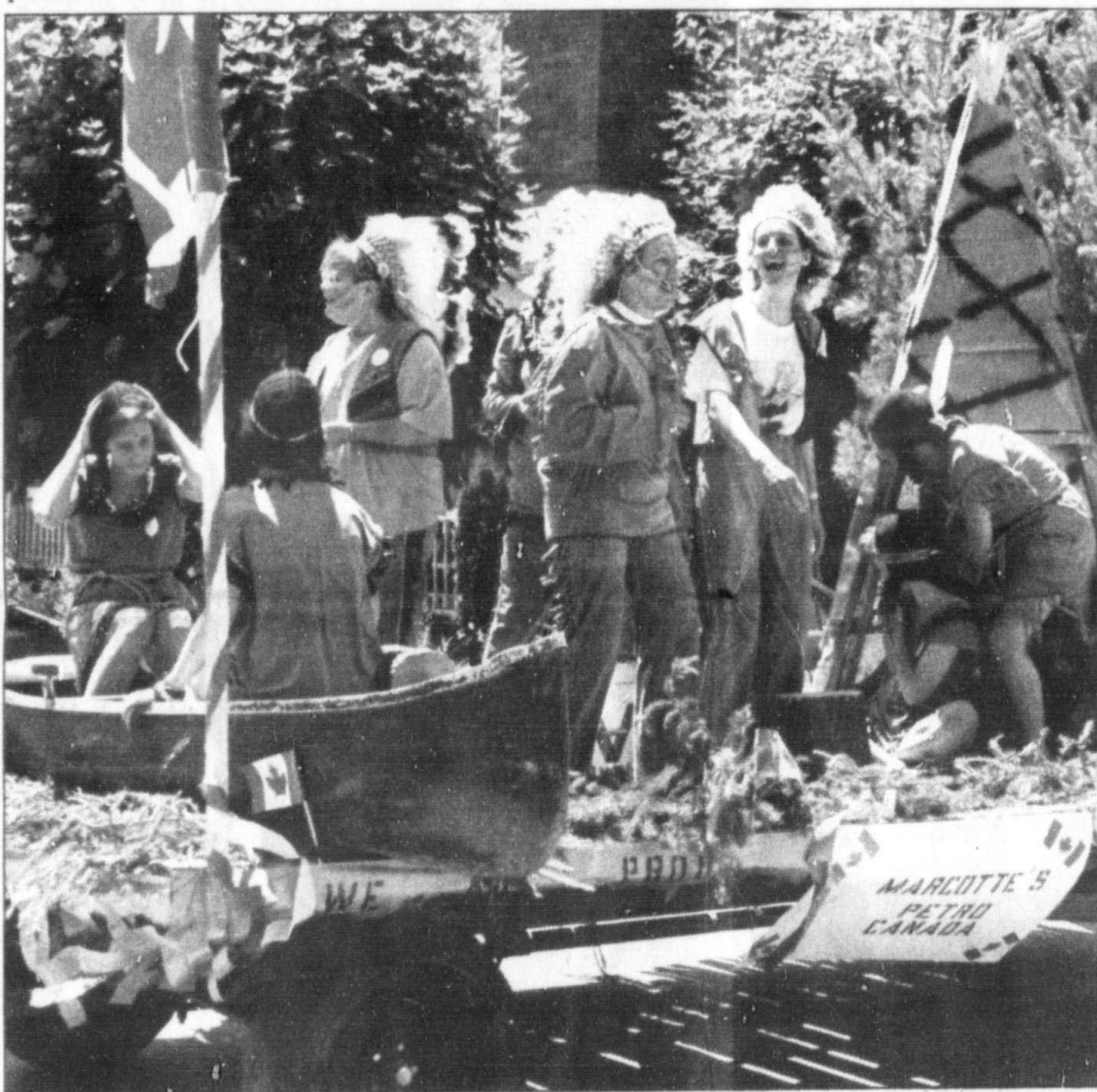
These lively Indians on the Marcotte's Petro-Canada float, added not only colour but good humour to the Canada Day Parade on June 30th, in Quyón.