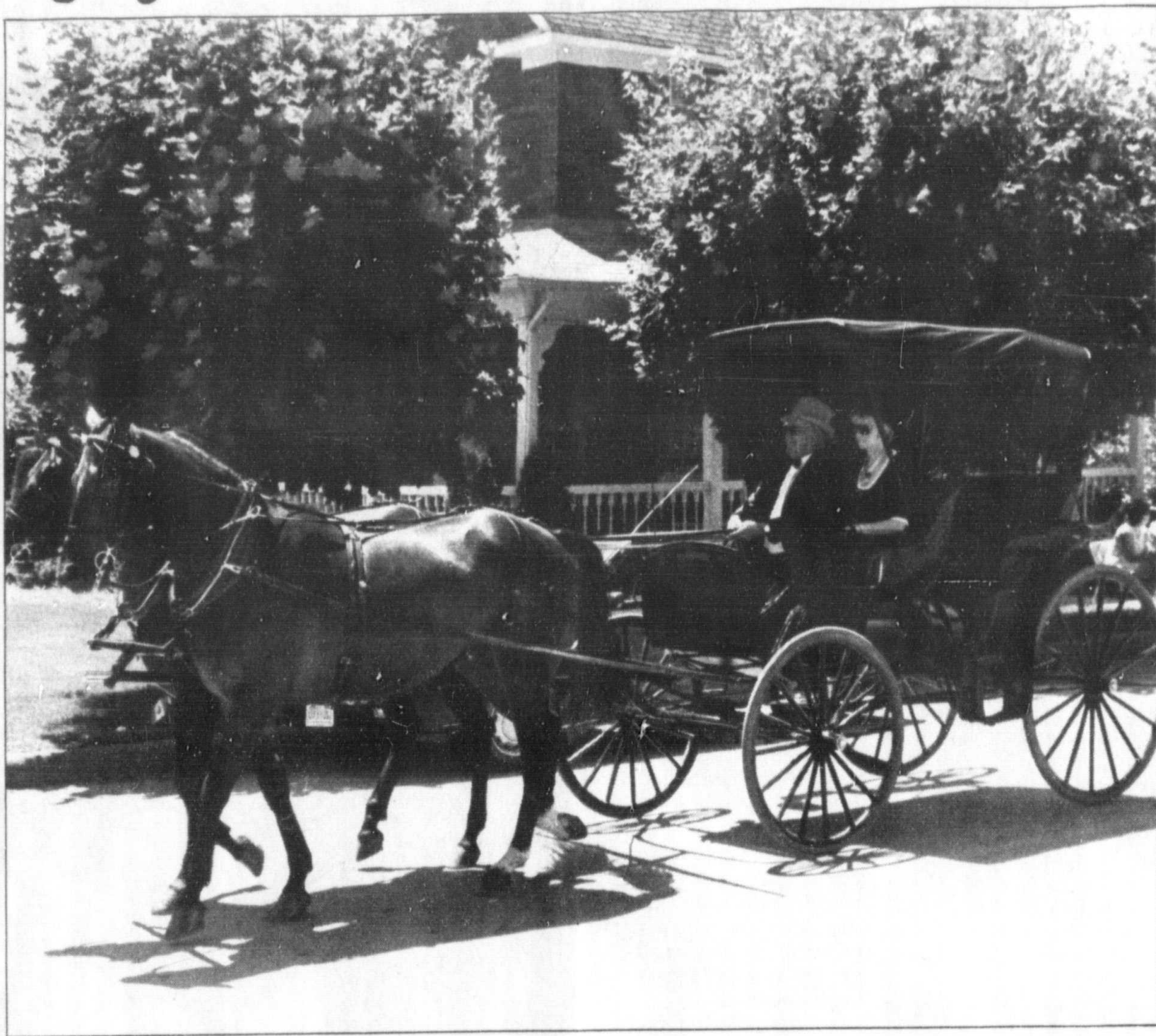
One of the Antique Vehicle entries of the Fair made its way down Main Street in Quyón for the Canada Day parade.