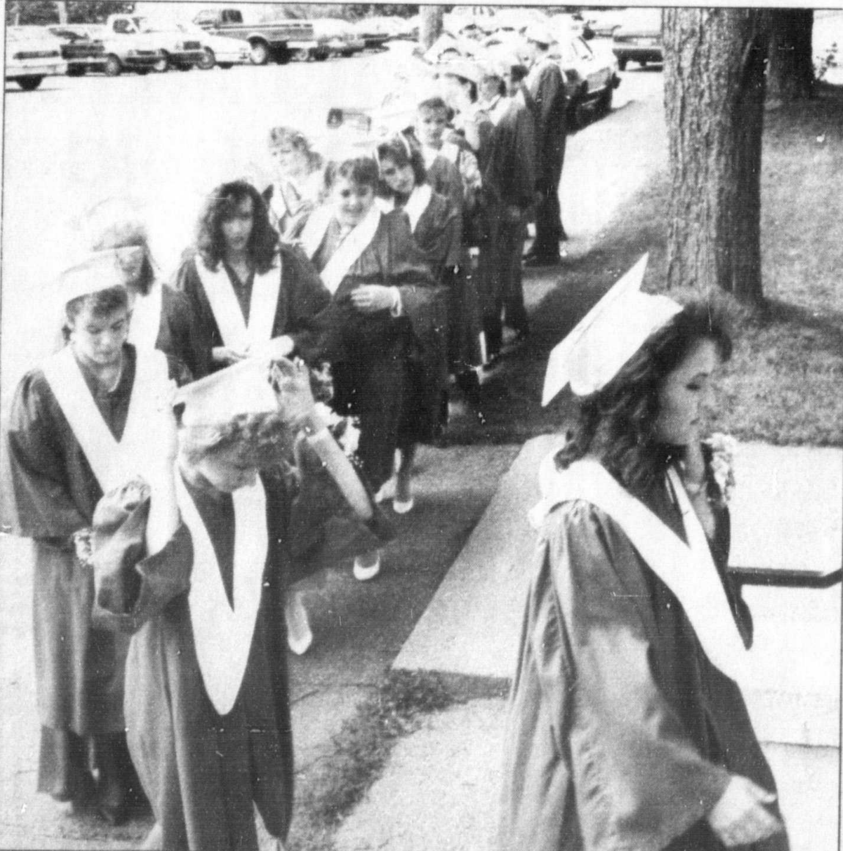
The 1991 graduating class from John Paul II High School in Campbell's Bay begin their final procession into St John the Evangelist Church on Front Street for their graduation ceremony on Saturday afternoon, June 22nd. Twenty-six students graduated from JP II this year.