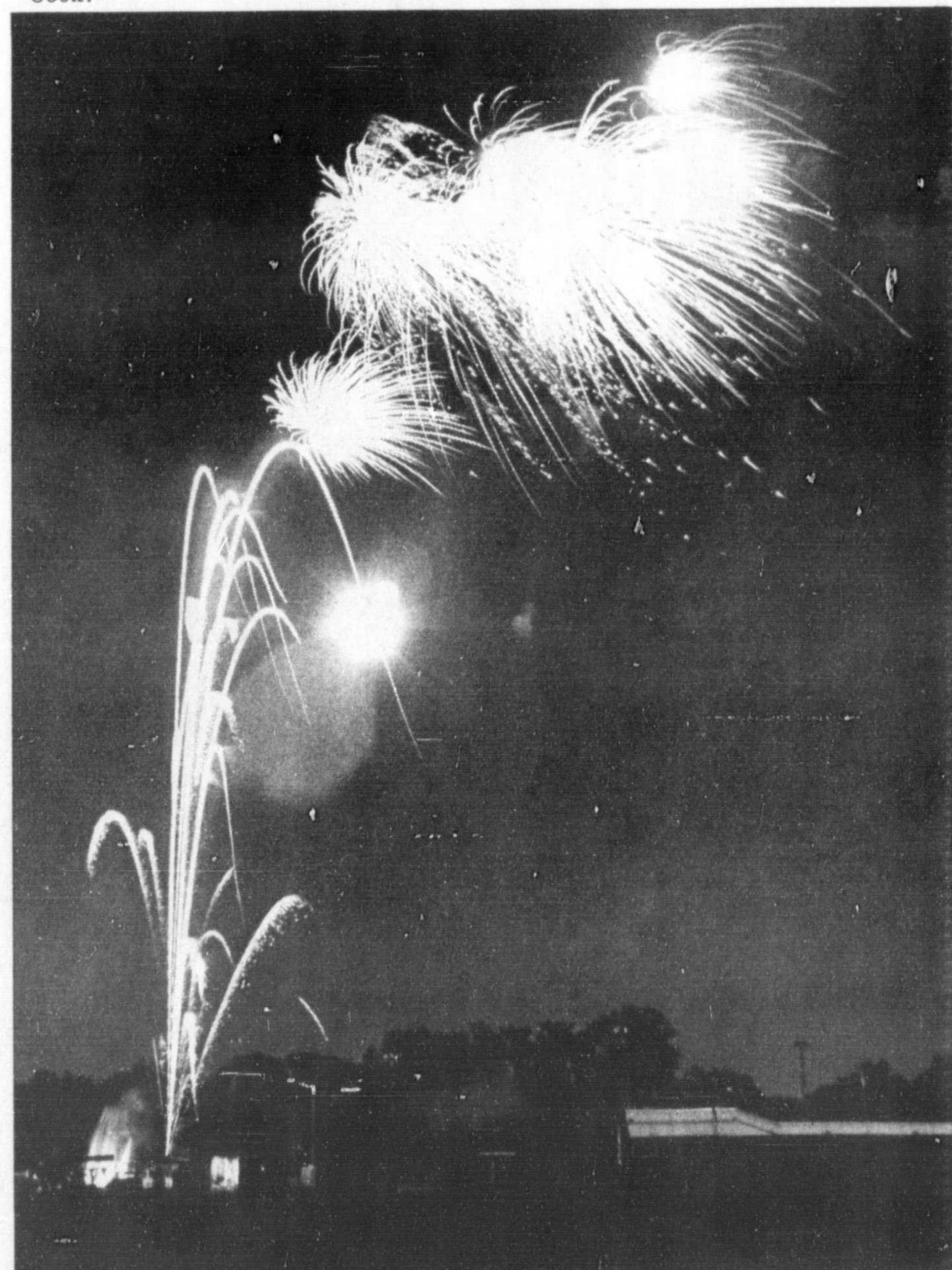
The Canada Day Committee put on a real light show for the crowd at the Quyón Fair grounds Sunday night. Oohs! and Aahs! were audible during the whole show.