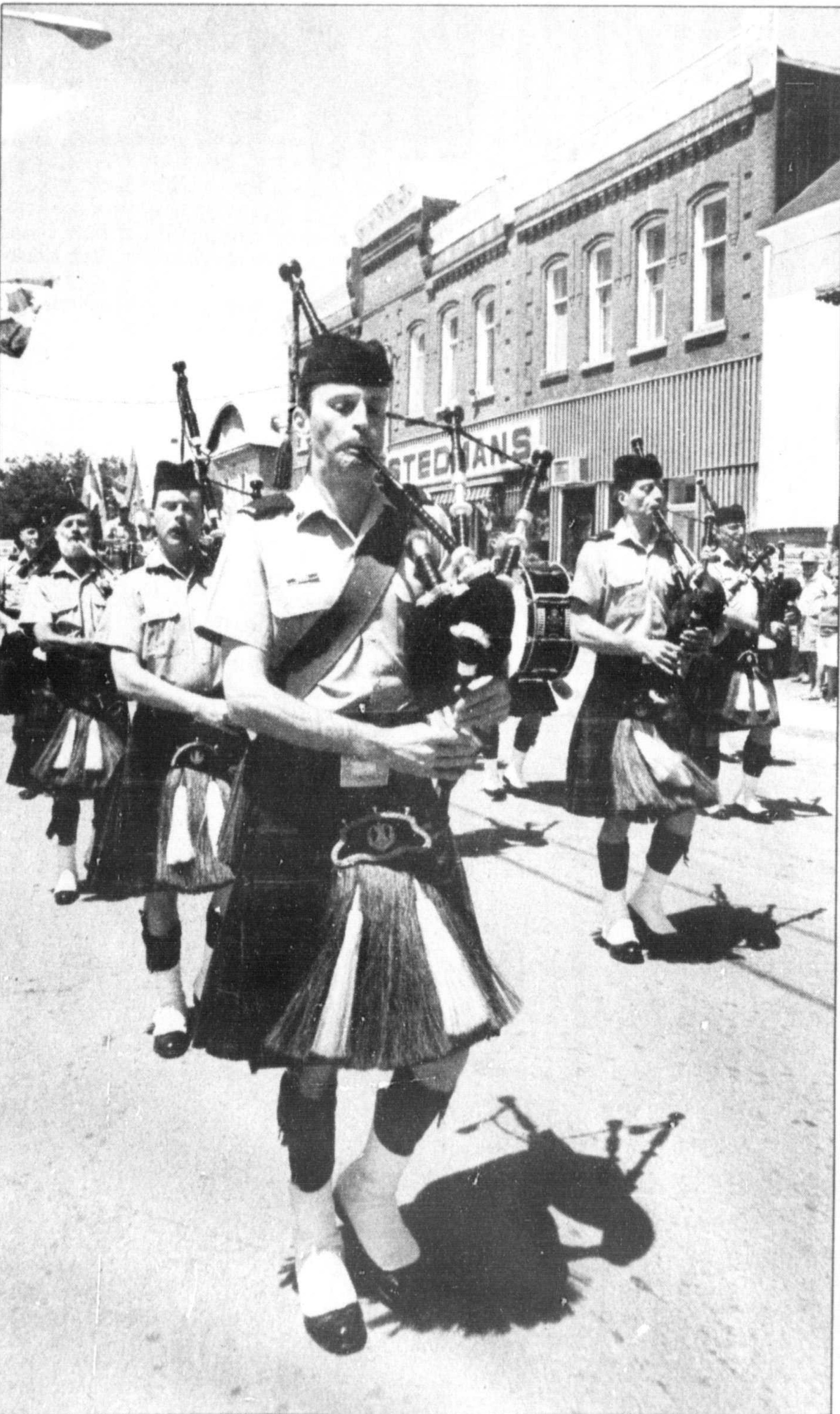
The Cameron Highland Band led 52 entries in the Canada Day parade on July 1st in Shawville. The parade stopped momentarily so that the Shawville-Clarendon fire trucks could break rank and speed away to a fire call, then the pageantry proceeded.