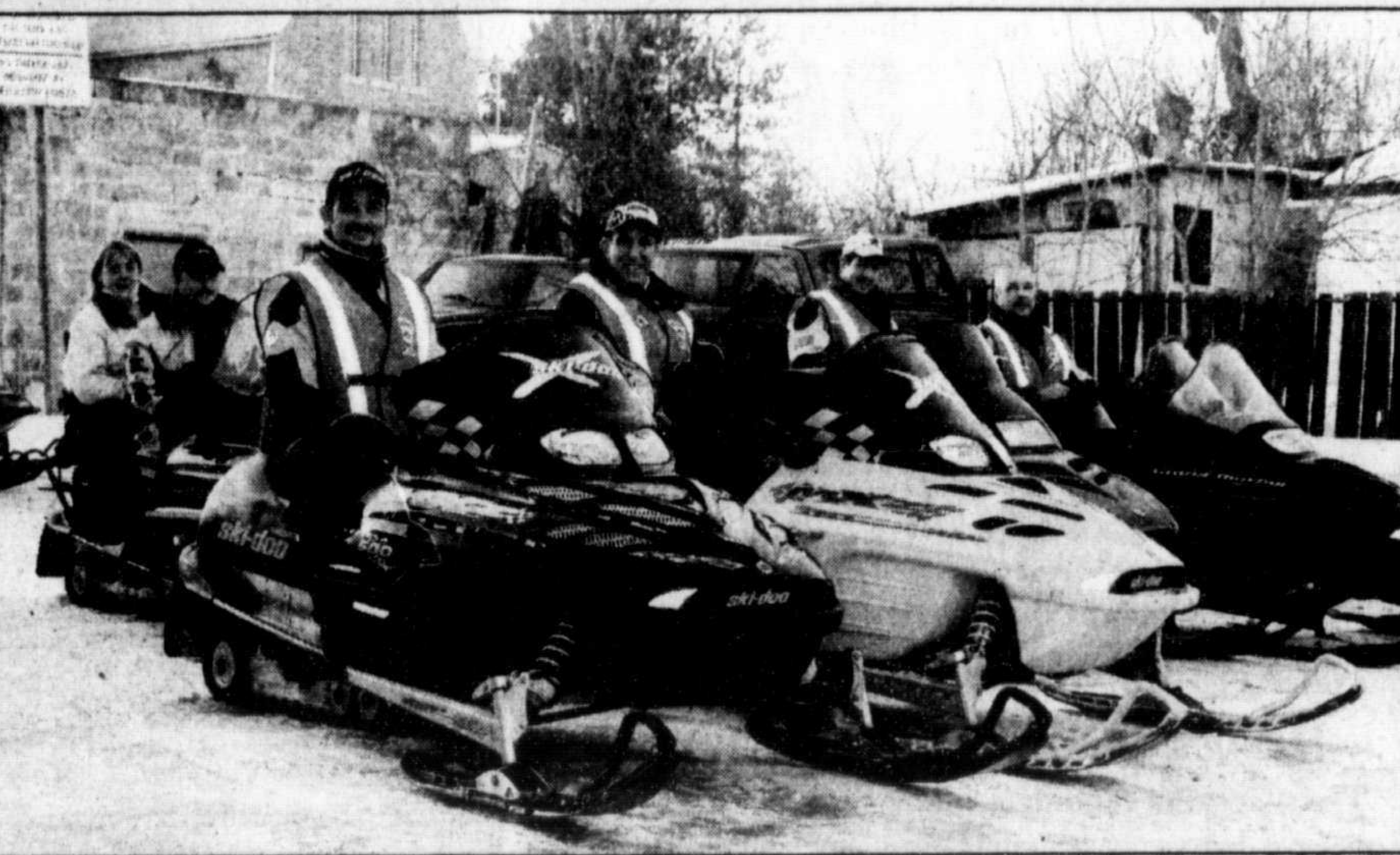
Participants of the Pontiac Snowmobile Drivers' Association hop on the backs of their machines after checking in at Gavan's Hotel as part of the group's poker run. Drivers visited businesses throughout the Pontiac and received stamps before returning to Gavan's and rolling dice to determine prize winners.