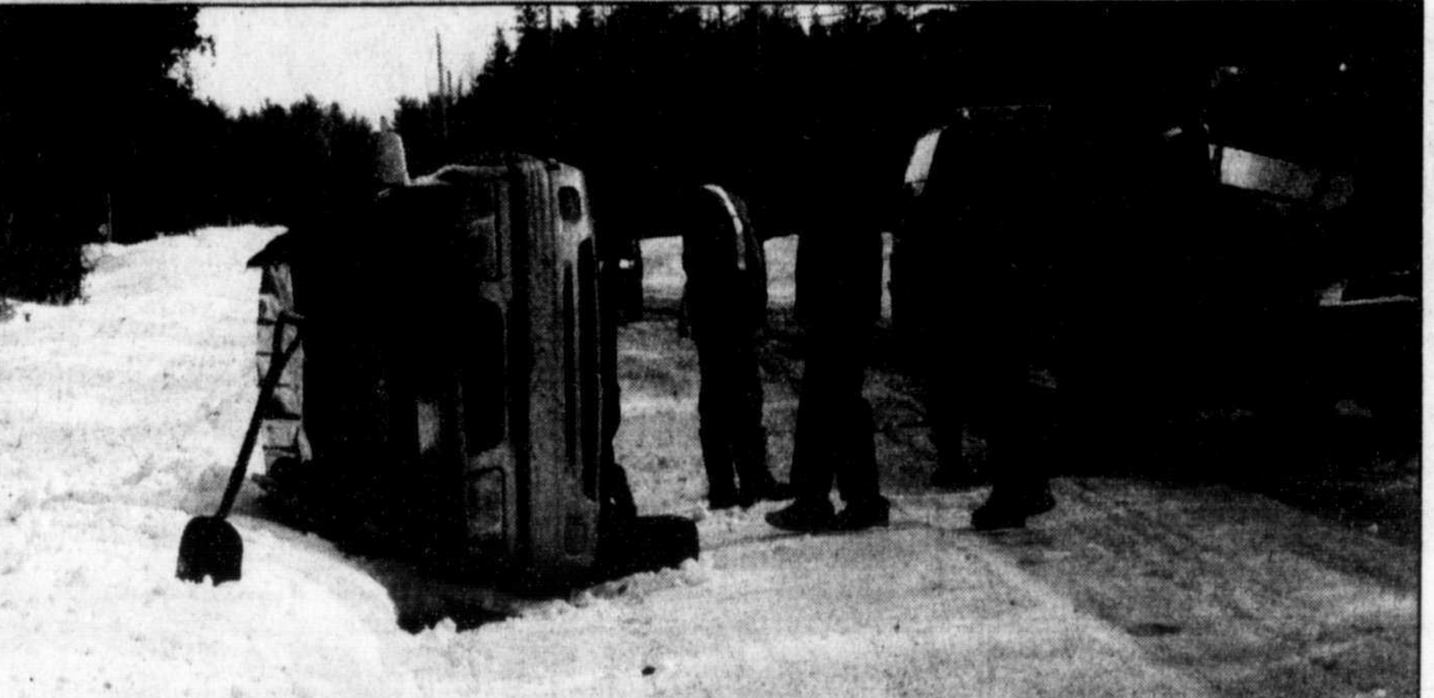
A woman driving a green Suzuki SUV lost control on Cottage Road on Allumettes Island near Hwy. 148. Police say icy conditions caused the accident, which sent the east-bound driver to hospital via ambulance with minor injuries.