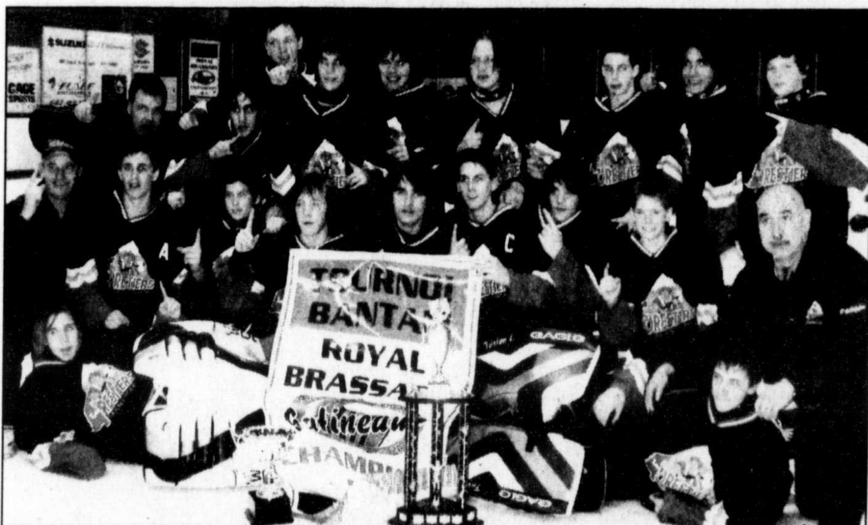
The Bantam 'BB' Maniwaki Forestiers, which is comprised of players from Fort Coulonge, Shawville and Maniwaki, won a tournament in Gatineau on the weekend.

The default victory extends the boys' record to 8-1 for the season, with three games remaining.